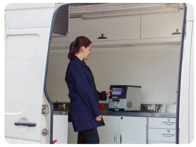
Mobile Lab is enclosed climate controlled lab with ambient temperature and humidity within product specification to obtain desired performance.

We used only the best materials to ensure it delivers unmatched performance in any application, and tested through intense shock, vibration and drop, per applicable IEC procedures.